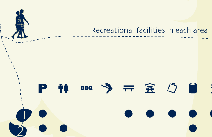
Fig.A - Red Hill

The Merricks general store is a genuine historic rural store built in 1927. There are also a number of wineries in the district. Merricks nestles in its wooded setting on the lower slopes of gently rolling hills and looks eastward to Western Port Bay. The Merricks Station Ground Reserve provides equestrian facilities, picnic facilities and amenities.